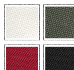
Available in natural, green, red & black