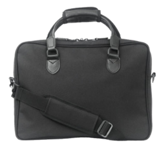
1113 Portfolio MSRP: $21.00 While Supplies Last!