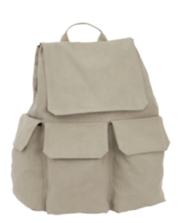
7320 Rucksack MSRP: $52.50