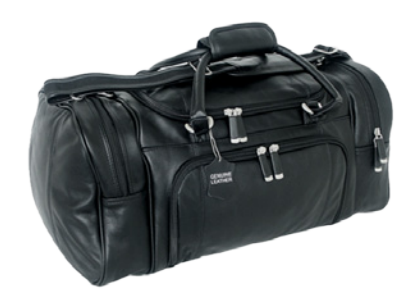
L5105 Sport Duffle MSRP: $260.00