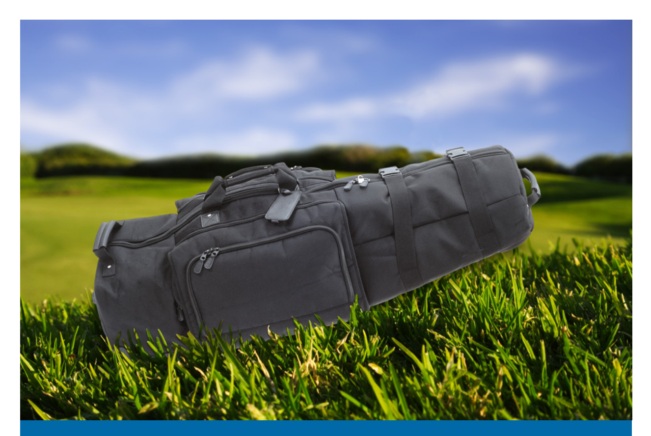
M7750 Wheeled Golf Travel Cover MSRP: $120.00

Mercury Luggage is proud to introduce Mercury Golf, collections of high quality bags custom debossed or embroidered to showcase your logo.