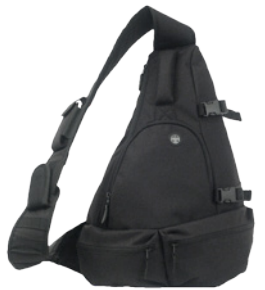
1148 Sling Bag MSRP: $27.00