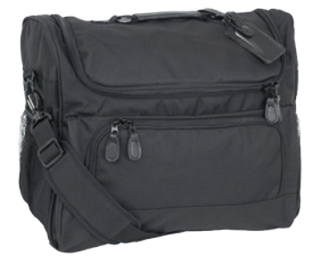
1140 Personal Tote MSRP: $33.50