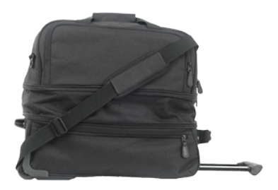
1119 Expandable Wheeled Duffle MSRP: $58.00