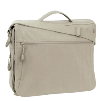
7324 Laptop Messenger Bag MSRP: $54.50