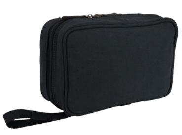
7807 Shave/Utility Kit MSRP: $19.50