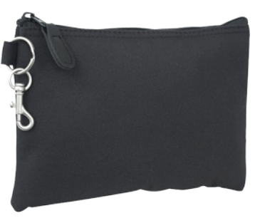
1170 Valuables Pouch MSRP: $5.50