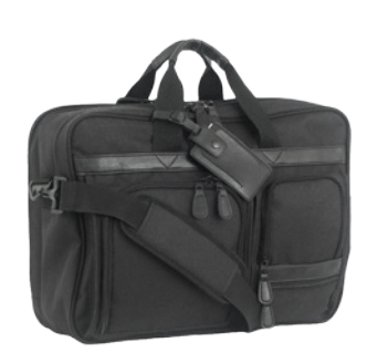
1116 Multi-Pocket Attaché MSRP: $32.50