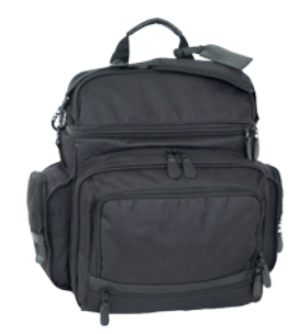
1180 Computer Backpack MSRP: $54.50