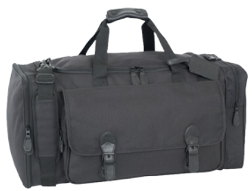
1106 Large Club Bag MSRP: $42.00

600 denier polyester with black lining, double stitched and corded seams, reinforced corners, and black hardware; available with silk screen or embroidery.