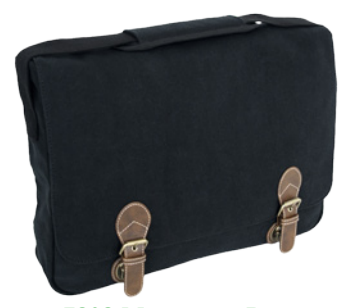
7808 Messenger Bag MSRP: $40.00