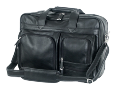
L5116 Deluxe Attache MSRP: $180.00